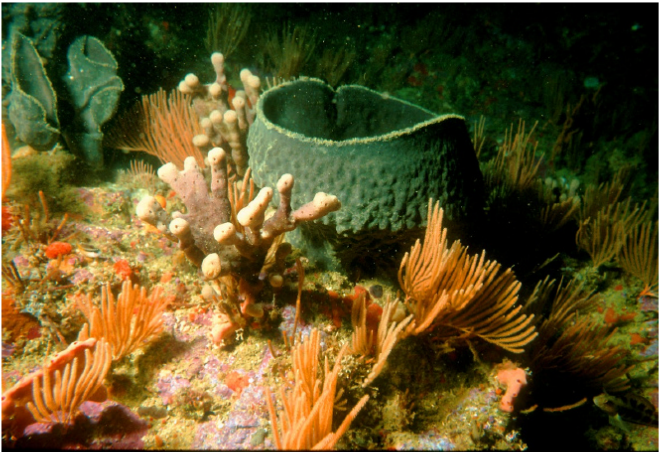
Mimiwhangata deep reef sponge and Gorgonian fans