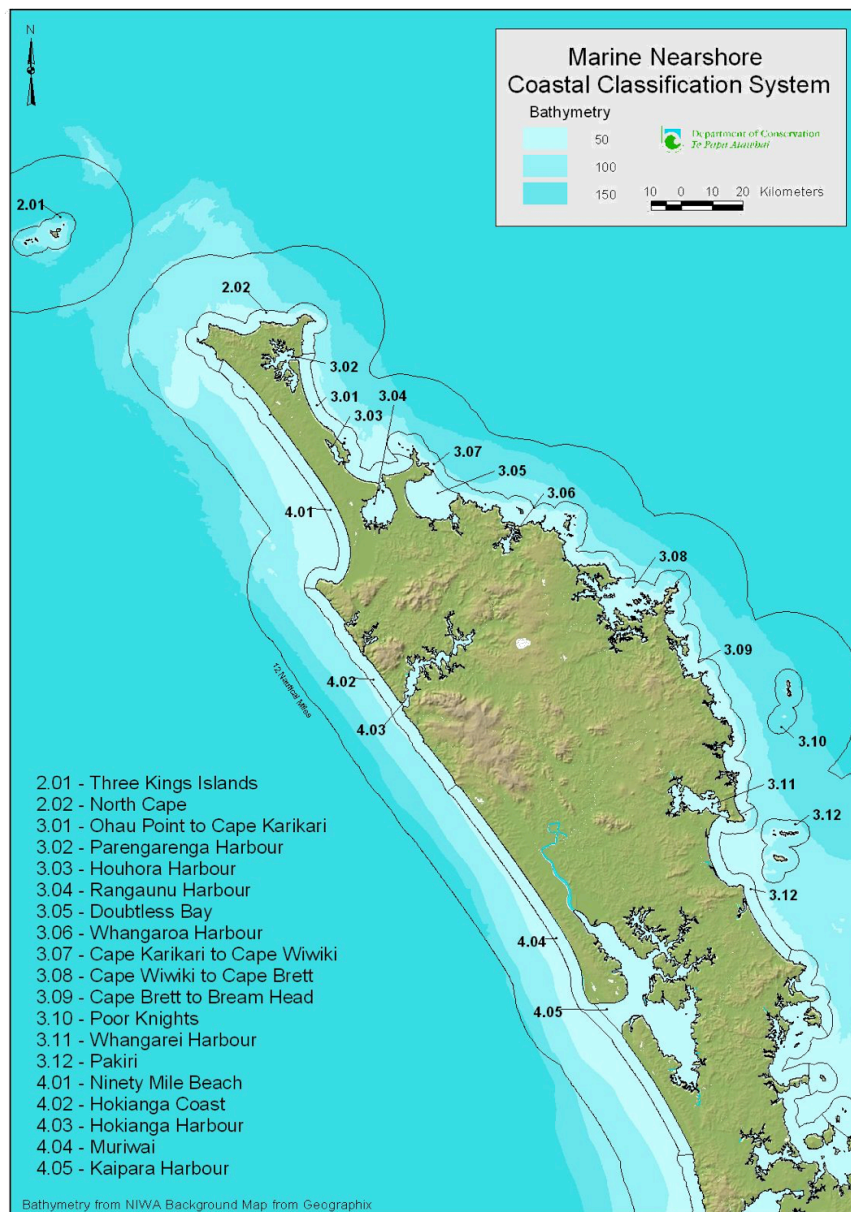
Figure 2 Marine Nearshore Coastal Classification System

the Northland coast including the estuaries, with the larger estuaries each constituting one coastal unit. See Figure 2.